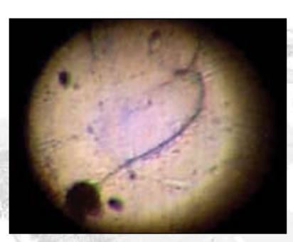
Figure 3 Rhizopus mold.

At the end of her presentation Dr. Marr showed new data on Rhizopus spp.<sup>5</sup> (Figure 3), which indicates that dead fungus can damage cells. This may explain the lack of efficacy of fungicidal agents in clinical disease.